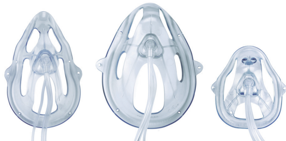
OxyMask™ ETCO 2 Adult