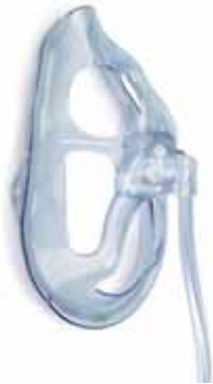
OxyMask™ O 2 Delivery