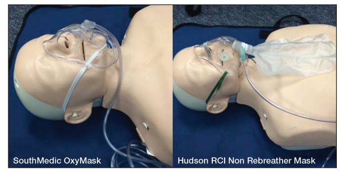
Figure 2) Left panel OxyMask^{TM} (Southmedic Inc, Canada). Right panel Hudson RCI<sup>®</sup> Non-Rebreather Mask<sup>TM</sup> (Teleflex Inc, USA)