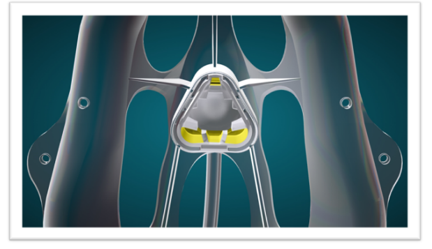
Oxy<sub>2</sub>Mask with enclosed diffuser and directional ports